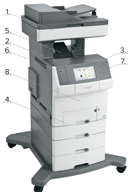
Lexmark XS748de color laser MFP shown with optional 2,000-sheet high capacity feeder and caster base.