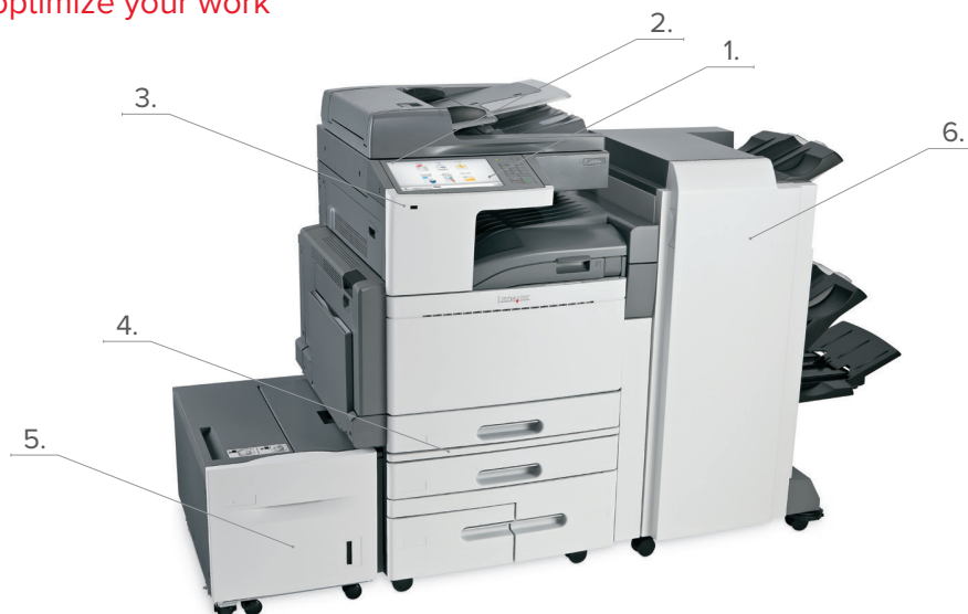
Lexmark XS955dhe color MFP with optional Booklet Finisher and 2,000-Sheet High Capacity Feeder